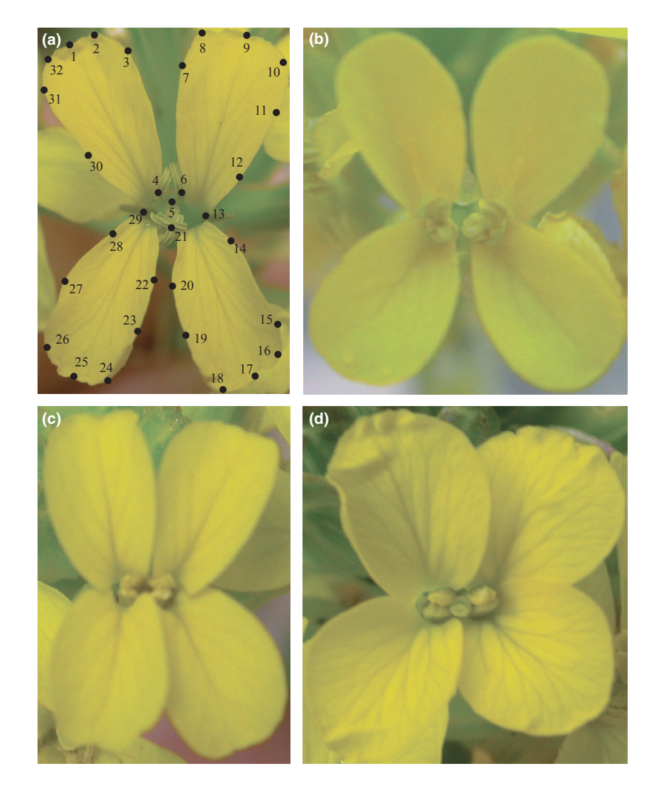
Fig. 1 Floral shape diversity in a wild population of Erysimum mediohispanicum (Brassicaceae). (a) Example of a flower that is almost perfectly symmetric about both the left–right and adaxial–abaxial axes. The configuration of landmarks used in the analysis is also shown. (b) Example of a flower with adaxial–abaxial asymmetry that is symmetric in the left–right direction (zygomorphy). (c) Example of a flower with left–right asymmetry, but with little adaxial–abaxial asymmetry. (d) Example of a completely asymmetric flower, both in the adaxial–abaxial and left–right directions.

In geometry, symmetry is defined as invariance under specific transformations (Weyl, 1952; Armstrong, 1988). Examples of transformations of this kind are reflection about a line or plane (from an object to its mirror image) or rotation by an angle that is an integer fraction of 360° (e.g. 90° or 180°). Another example of a transformation is the identity, which leaves the object unchanged (it is equivalent to two successive reflections about the same axis or a rotation by 360°). An object is considered symmetric if it remains the same after a transformation has been applied to it. The object's symmetry can be characterized by the set of transformations that leave it unchanged in this manner. These transformations are called symmetry transformations. For instance, zygomorphic flowers are symmetric under two transformations: reflection about the median plane and the identity. Disymmetric flowers are symmetric under reflections about two perpendicular axes, their combination (a rotation by 180°) and the identity. Equivalently, disymmetry can be defined by a reflection about one axis and a rotation by 180°, their combination (a reflection about the perpendicular axis) and the identity (Fig. 2).